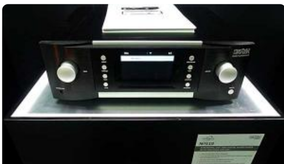
High End Munich 2019: Mark Levinson Strikes Again