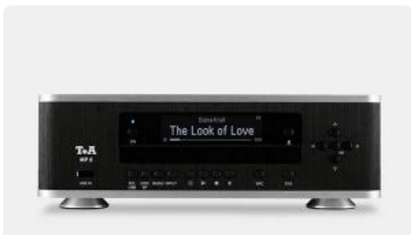
High End Munich 2019 with T+A