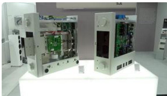
High End Munich 2019: CD is The New CD, Wireless Systems and the Super Integrated