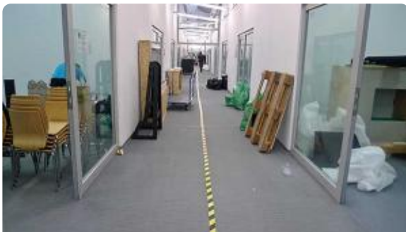
High End Munich 2019 Wrap: The Four Cycles of Audiophile Combustion