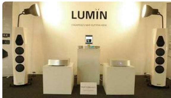
High End Munich: Into the Light with Lumin