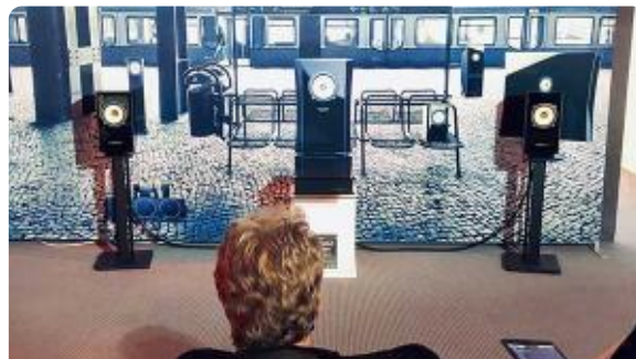
High End Munich Stays Simple with Voxativ Absolut