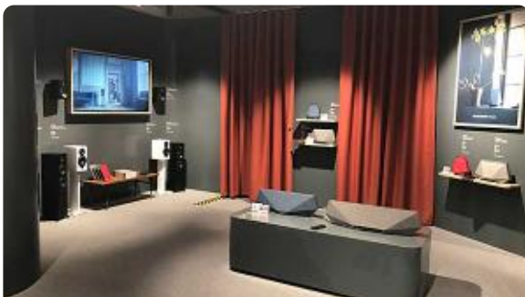
High End Munich 2019: Dynaudio and the Wireless Paradigm