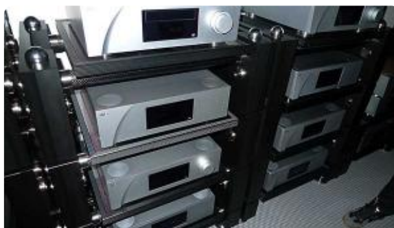
High End Munich 2019 with CH Precision